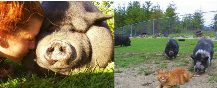
top-left: Bossy; top-right: "da gang"; bottom: Rocko and Snowball